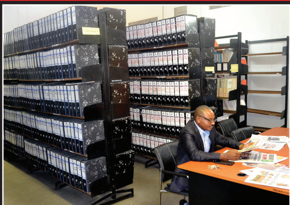
Information dissemination in the TBS Library