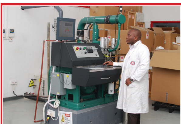
Testing of Research Octane Number (RON) in petrol in the Chemistry Laboratory.

The Chemistry Laboratory at the TBS Test House has been established to provide test facilities and services for all chemical and allied products, including petroleum products.