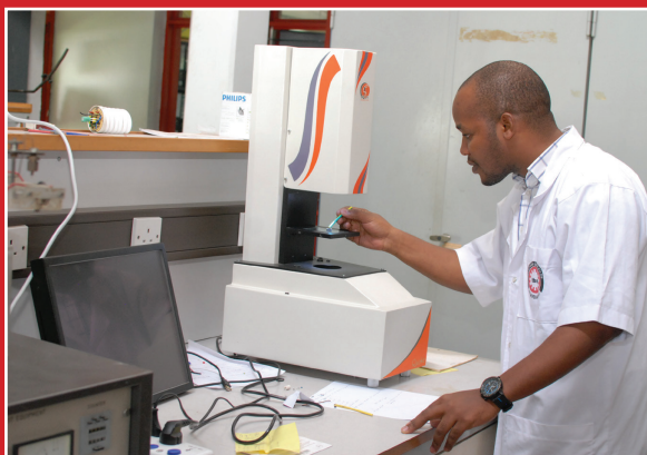
Engineer testing insulation thickness of a cable in the Electrical Laboratory