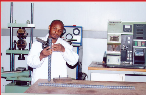
Testing of steel bars in the Mechanical Laboratory

The Mechanical Engineering Laboratory is equipped with facilities for testing metallic materials with a wide range of tests being carried out to determine different properties of metals. The Laboratory also offers consultancy services such as suitability for use of products needing general mechanical tests using local, national and international standards.