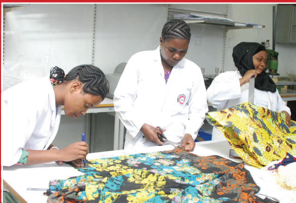
Sample preparation in the Textile and leather laboratory