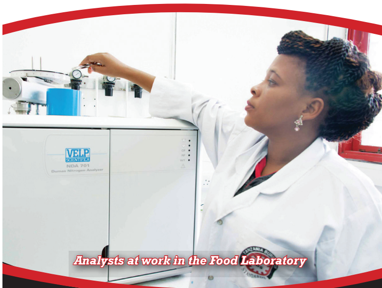
Analysts at work in the Food Laboratory