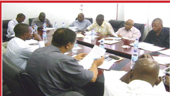
A Technical Committee deliberates on draft standards.

The finalized standards include product standards, test methods, codes of practice and codes of hygiene. The standards cover various sectors of the economy including food and agriculture, chemicals, textiles and leather, engineering, environment and general techniques.