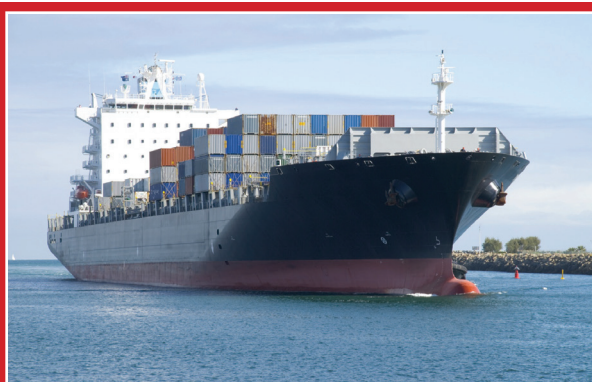
Under PVoC consignments are inspected prior to shipment into Tanzania

The program is carried out by authorized third-party agencies, consisting of physical inspection with combination of laboratory testing, documentary review and factory audits.