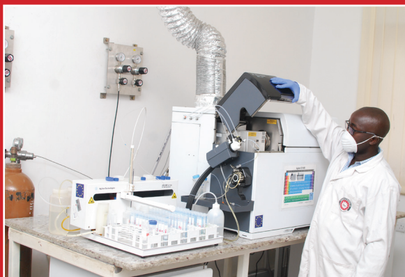
Sample analysis in the food laboratory

The Food Laboratory at the TBS Test House, provides test facilities for all food and agricultural products. Tests are carried out to detect contaminants of all types and prove food wholesomeness and safety.