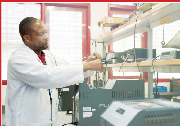
Dry Block Machine for temperature calibration