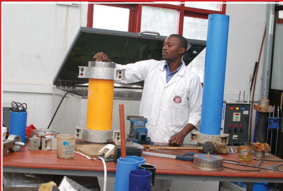
sample analysis in the Building and Construction Laboratory