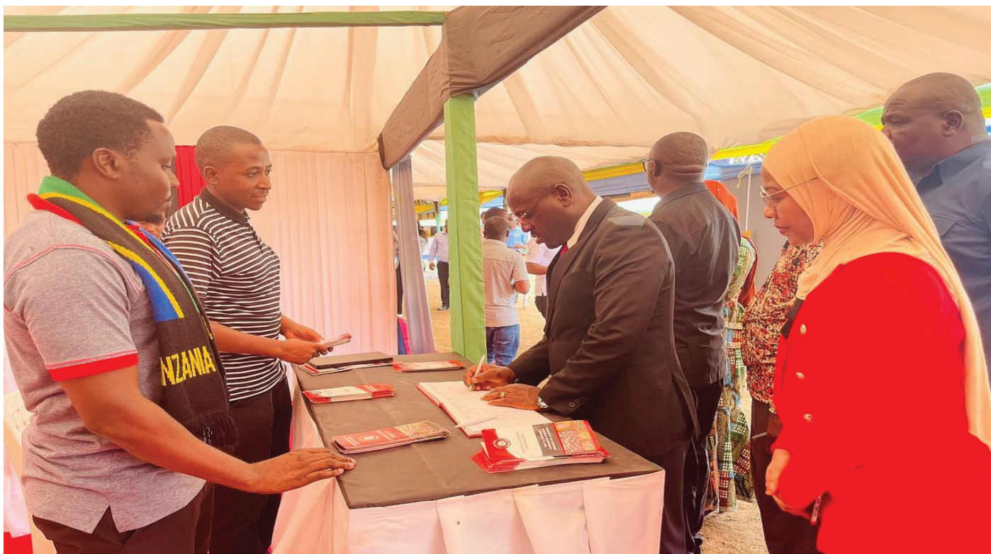
The Deputy Minister of Industry and Trade, Hon. Exaud Kigahe signs in the visitors' book at the TBS pavilion during the Tanzanite Exhibition in Manyara.