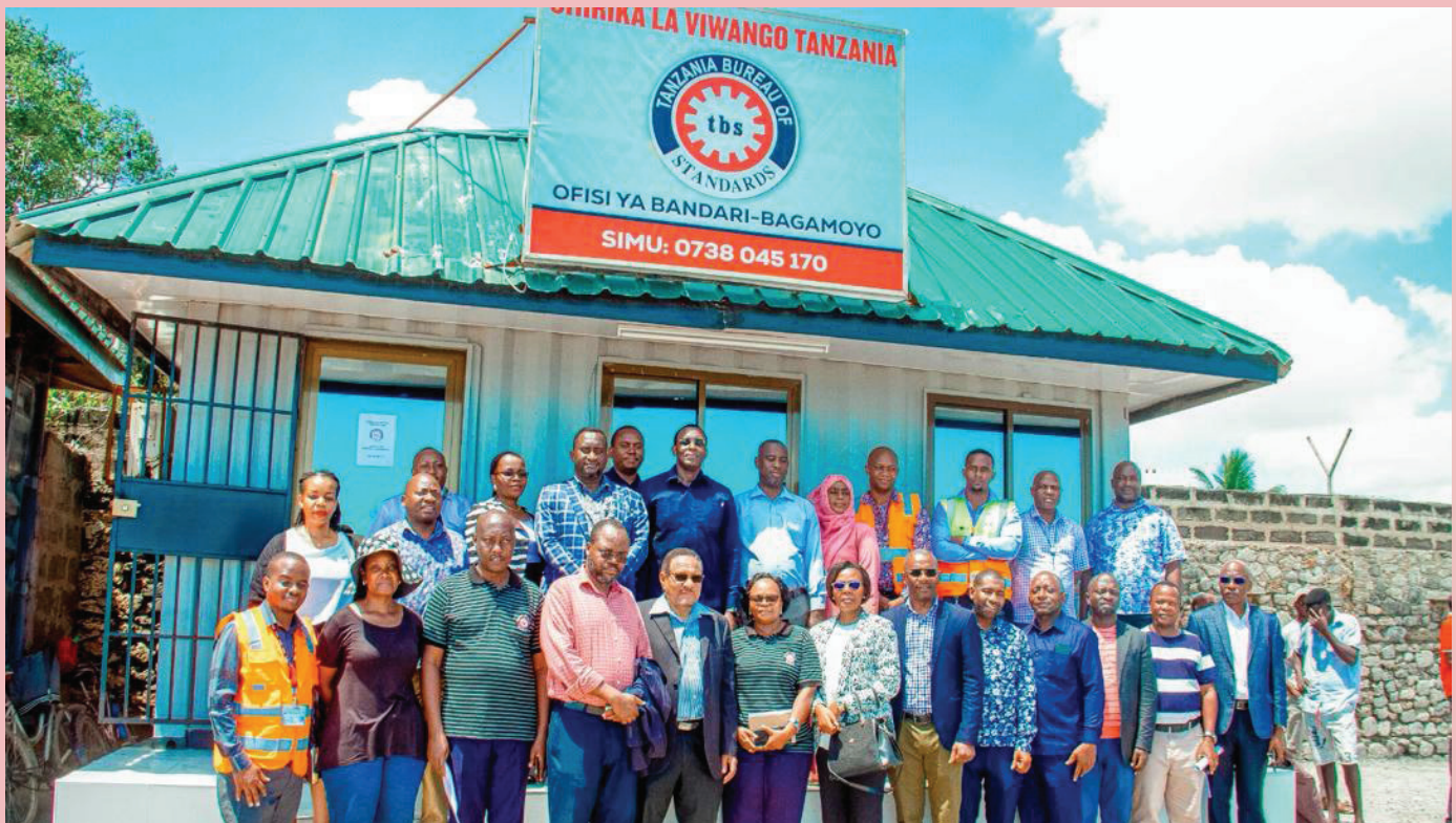
Members of the TBS Board of Directors pose for a photo with members of the TBS Management and staff during their official visit at the TBS Bagamoyo Port Office.