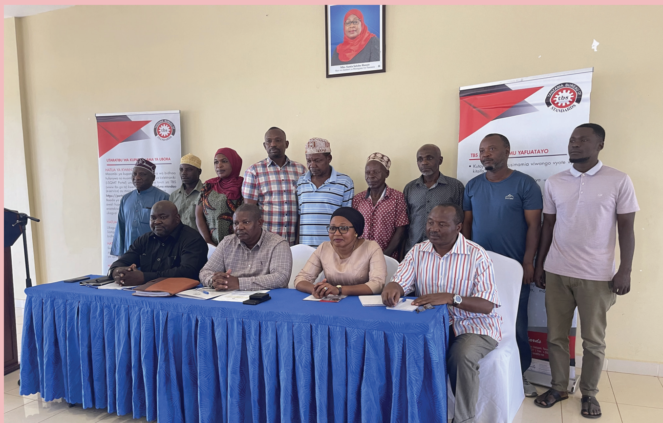
Mtwara Regional Commissioner, Col. Ahmed Abbas Ahmed (second left, seated) poses with other leaders and salt stakeholders during training on products safety and quality in Mtwara region.